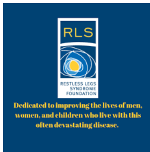
Restless Legs Syndrome Foundation