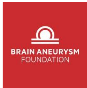
Brain Aneurysm Foundation