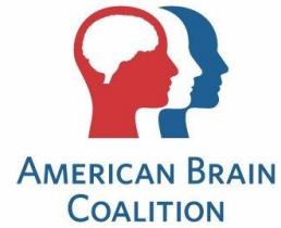
American Brain Coalition