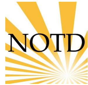
National Organization for Tardive Dyskinesia