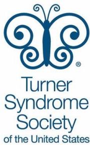
Turner Syndrome Society of the United States