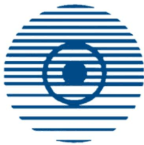
Benign Essential Blepharospasm Research Foundation