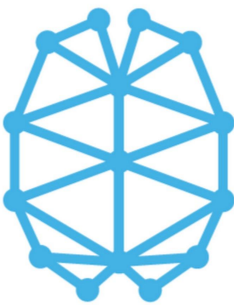
OurBrainBank for Glioblastoma