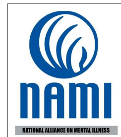
National Alliance on Mental Illness