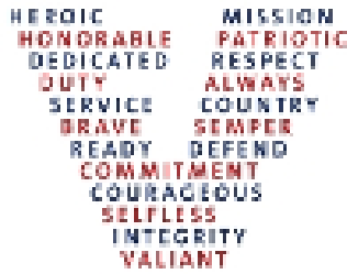
Cohen Veterans Bioscience