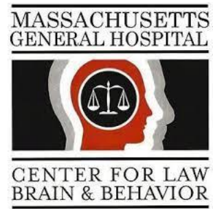
Center for Law, Brain & Behavior